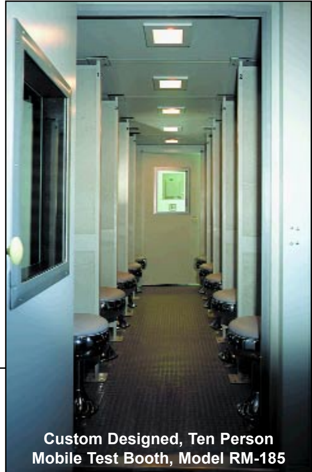
Custom Designed, Ten Person Mobile Test Booth, Model RM-185

Double wall booths provide increased isolation when ambient conditions prohibit a single wall configuration to meet ANSI specifications. Double wall booths also provide additional acoustic control to isolate patients from waiting room noise.